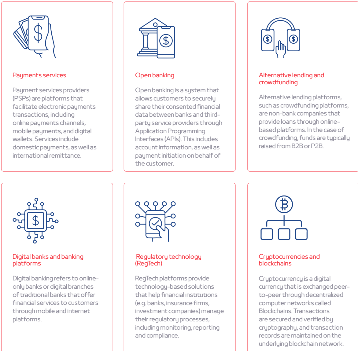
Figure 1: Key FinTech Verticals in Bahrain